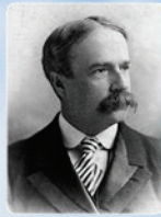
JOSEPH PRICE REMINGTON Permanent Secretary 1893–1894