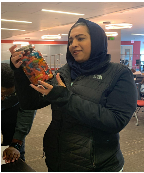
Pictures 3-4. (Left) Drug Emoji Challenge (Right) Guess the "Pills" in a Jar