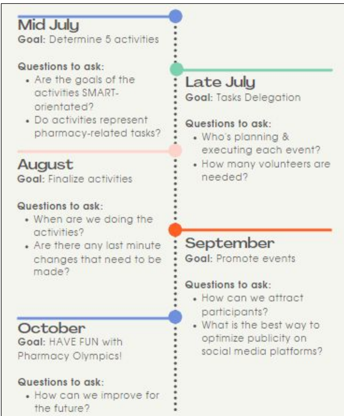
Figure 1. Description of how the Pharmacy Olympics was planned and executed.