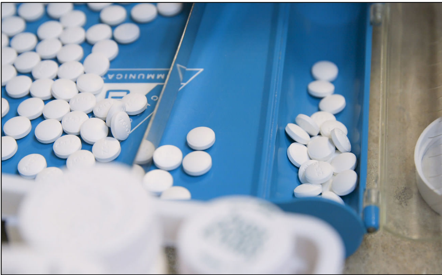
Faith Pharmacy provides free medications for patients upon referral from a partnered provider

Salvation Army Clinic, Mission Frankfort, and Faith Pharmacy are the cornerstones for our community outreach efforts at the University of Kentucky College of Pharmacy.