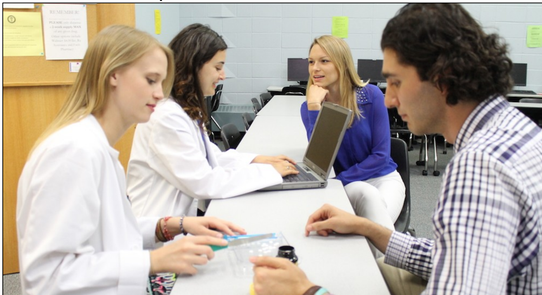
Student pharmacists providing patient consultation under direct supervision at Mission Frankfort

These community outreach programs were developed by student pharmacists to serve the community in a more direct way.